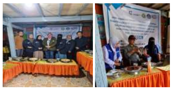
Figure 2 Product Innovation Training and Assistance

persons also provided material related to the importance of Brand and Packaging of a product.