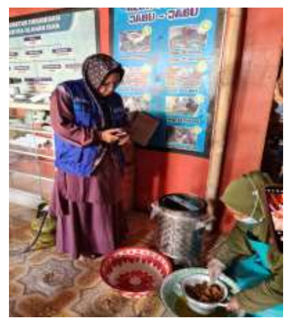
Figure 4 Application of Technology and Innovation (Spinner Machine)

Partners are provided with assistance in the production of fish floss, namely partners are also taught how to use appropriate technology, namely oil slicing machines ( spinners ) to reduce oil levels in processed Konnya Fish floss products.