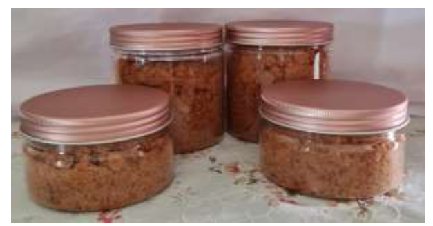
Figure 3 Results of packaging and product innovation

As a result of this activity, partners understand the importance of product innovation. So that partners produce processed Konya fish (cockatoo) products in the form of shredded konya fish flavor variants (original and spicy) as well as konya fish bajabu.