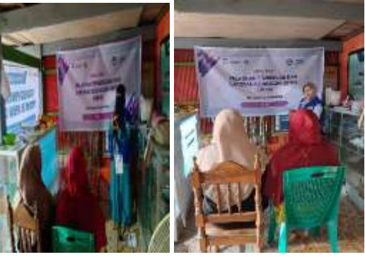
Figure 8 Bookkeeping training and assistance

The result of bookkeeping training and assistance activities is an increase in partners' knowledge about bookkeeping and the importance of business recording. Increased partner awareness on how to calculate Cost of Production (COGS).