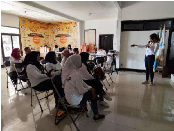
Figure 7. Business Communication Training: Public Speaking

The public speaking produced is a systematic communication designed for partners who are members of Pokdarwis, facilitating their roles as tour guides at Binong Jati Knitting Creative Tourism Urban Village. The partner's proficiency in storytelling and relevant understanding of the area's potential, along with the use of suitable language, constitutes the technology and innovation tailored to the profile of tourists visiting Binong Jati Knitting Creative Tourism Urban Village [18]. The significance of consistency in the application of qualities is a crucial aspect of public speaking.