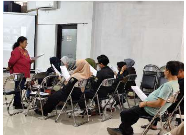
Figure 8. Business Communication Training: Basic English Skills

Basic English skills utilized will pertain to essential speaking abilities relevant to the responsibilities of Pokdarwis members in engaging with overseas tourists [19]. Partners will receive books that serve as a reference for effectively and accurately communicating terminology in suitable English.