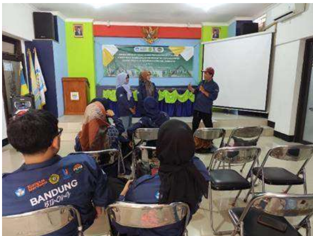
Figure 11. Application of Business Communication Technology: Public Speaking

Business communication encompasses two domains: public speaking and basic English skills. The implementation of public speaking technology is facilitated by individual expertise and complementary traits. The relevant qualities are the standardized attire of tour guides at Binong Jati Knitting Creative Tourism Urban Village, serving as a component of the personal branding for the Pokdarwis Binong Jati Knitting Creative Tourism Urban Village identity.