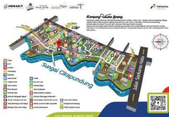
Figure 2. Map of Tourism Potential in Binong Jati Knitting Creative Tourism Urban Village

The Binong Jati Knitting Industry Center is a small and medium industry (SMEs) hub in Bandung City, established in 1960. As of now, there are 323 verified company units still functioning at the Binong Jati Knitting Industry Center [3]. The Bandung City Government, via the Bandung City Culture and Tourism Office, is endeavoring to integrate the attributes of industrial centers, emphasizing profitability, with community empowerment through the concept of a creative tourism urban village. This initiative aims to offer opportunities for local residents not involved in knitting production to participate in regional development across various sectors, including culinary arts, souvenirs, arts and culture, and tour guiding.