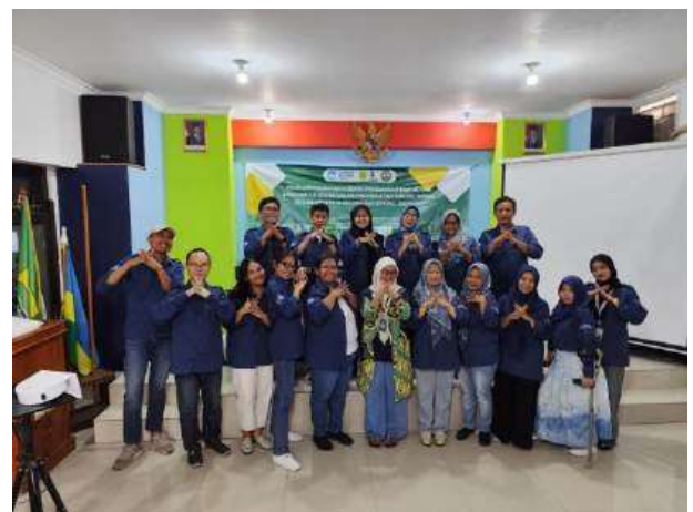
Figure 13. Group Photo of Community Service Team and Mentoring Participants from Binong Urban Village

Mentoring is conducted using the Training of Trainers (ToT) model, ensuring the sustainability of the community-based mentoring program begun by the team of lecturers, allowing members of the Pokdarwis Binong Jati Knitting Creative Tourism Urban Village, who are participants in the mentoring, to extend their knowledge to new members. Upon the conclusion of the mentoring process, partners are dedicated to establishing internal mentoring among members of the Pokdarwis Binong Jati Knitting Creative Tourism Urban Village to disseminate knowledge and apply concepts pertaining to digital marketing management and business communication.