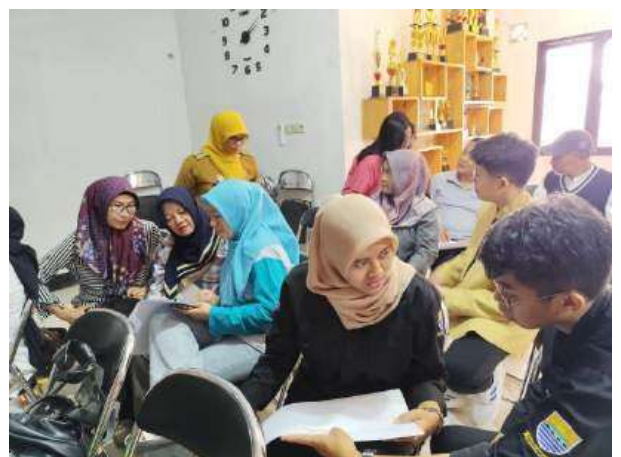
Figure 9. Implementation of Digital Marketing Management Technology: Content Marketing

The integration of technology and innovation in this aid is categorized into two areas of science and technology: digital marketing management and business communication. Digital marketing management will examine two domains: content marketing and social media marketing. To apply science and technology in content marketing and social media marketing, the necessary technology encompasses two components: physical and non-physical infrastructure. Content marketing and social media marketing necessitate lighting, music, and ancillary tools that align with the content notion [20]. Content marketing and social media marketing necessitate editing software to enhance the visual quality of the raw materials utilized in content creation.