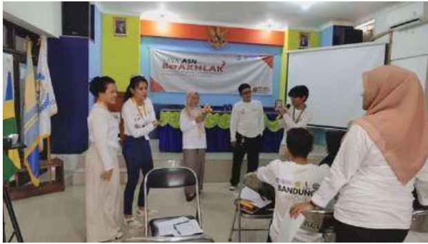
Figure 10. Implementation of Digital Marketing Management Technology: Social Media Marketing

Business communication encompasses two domains: public speaking and basic English skills. The implementation of public speaking technology is facilitated by individual expertise and complementary traits. The relevant qualities are the standardized attire of tour guides at Binong Jati Knitting Creative Tourism Urban Village, serving as a component of the personal branding for the Pokdarwis Binong Jati Knitting Creative Tourism Urban Village identity.