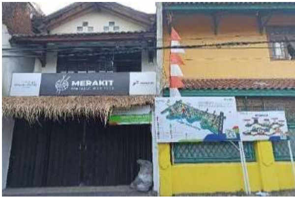
Figure 1. Binong Jati Knitting Creative Tourism Urban Village Gallery

The Binong Jati Knitting Industry Center is a small and medium industry (SMEs) hub in Bandung City, established in 1960. As of now, there are 323 verified company units still functioning at the Binong Jati Knitting Industry Center [3]. The Bandung City Government, via the Bandung City Culture and Tourism Office, is endeavoring to integrate the attributes of industrial centers, emphasizing profitability, with community empowerment through the concept of a creative tourism urban village. This initiative aims to offer opportunities for local residents not involved in knitting production to participate in regional development across various sectors, including culinary arts, souvenirs, arts and culture, and tour guiding.