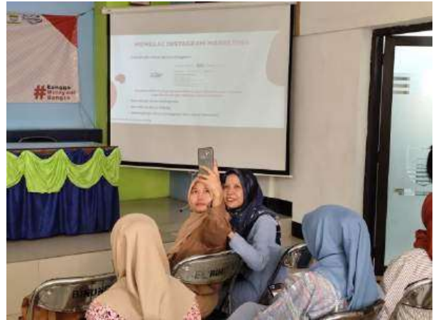
Figure 6. Digital Marketing Management Training: Social Media Marketing

Social media marketing will be formulated based on the familiarity of partners and the attributes of tourists who represent the personas of Binong Jati Knitting Creative Tourism Urban Village. Partners will establish the monthly themes for development, specify the types of material to be produced, and oversee social media accounts through straightforward campaigns. By effectively managing social media accounts, partners may sustain contact with prospects, consumers, and customers consistently, particularly tourists visiting Binong Jati Knitting Creative Tourism Urban Village.