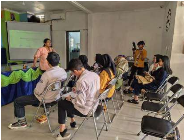
Figure 5. Digital Marketing Management Training: Content Marketing

Content marketing will be executed by enhancing partners' comprehension of the many material formats, including text, audio, and graphics. The chosen content kinds, reflecting the topics outlined in the content calendar, will encompass the technology and innovation offered to partners. Variations in innovative methodologies in content marketing seek to enhance brand recognition of Binong Jati Knitting Creative Tourism Urban Village, which will subsequently be expanded in social media marketing.