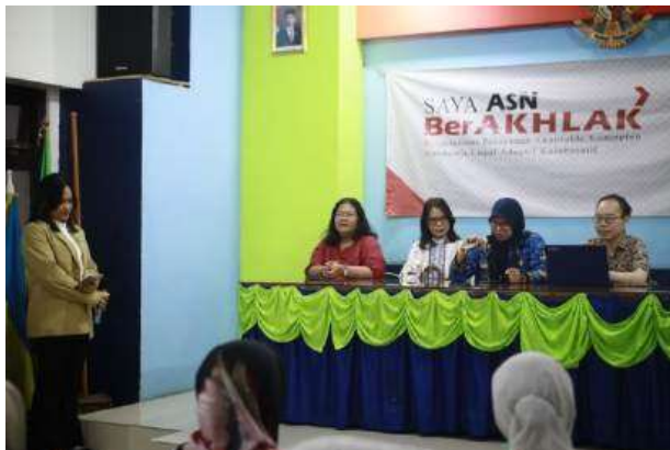
Figure 4. Socialization of the Ministry of Education, Culture, Research and Technology's Community Service Program 2024

Socialization occurs through the initiation of communication with partners. The community service team will visit the local government apparatus in Binong Urban Village, Batununggal District, the site of the Binong Jati Knitting Creative Tourism Urban Village. Furthermore, the community service team will elucidate to the members of the tourism awareness group (Pokdarwis) the introduction of community service team personnel, MBKM ( Merdeka Belajar Kampus Merdeka/Independent Learning Independent Campus ) students, and provide a comprehensive overview of the mentoring program, including necessary preparations for the mentoring process during the program's socialization.