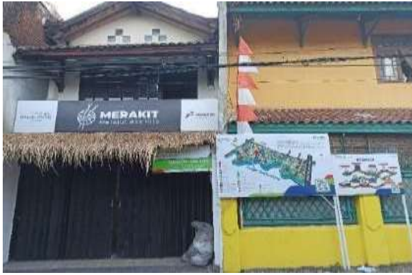
Figure 1. Binong Jati Knitting Creative Tourism Urban Village Gallery

The Binong Jati Knitting Industry Center is a small and medium industry (SMEs) hub in Bandung City, established in 1960. As of now, there are 323 verified company units still functioning at the Binong Jati Knitting Industry Center [3]. The Bandung City Government, via the Bandung City Culture and Tourism Office, is endeavoring to integrate the attributes of industrial centers, emphasizing profitability, with community empowerment through the concept of a creative tourism urban village. This initiative aims to offer opportunities for local residents not involved in knitting production to participate in regional development across various sectors, including culinary arts, souvenirs, arts and culture, and tour guiding.