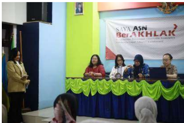
Figure 4. Socialization of the Ministry of Education, Culture, Research and Technology's Community Service Program 2024

Socialization occurs through the initiation of communication with partners. The community service team will visit the local government apparatus in Binong Urban Village, Batununggal District, the site of the Binong Jati Knitting Creative Tourism Urban Village. Furthermore, the community service team will elucidate to the members of the tourism awareness group (Pokdarwis) the introduction of community service team personnel, MBKM ( Merdeka Belajar Kampus Merdeka/Independent Learning Independent Campus ) students, and provide a comprehensive overview of the mentoring program, including necessary preparations for the mentoring process during the program's socialization.