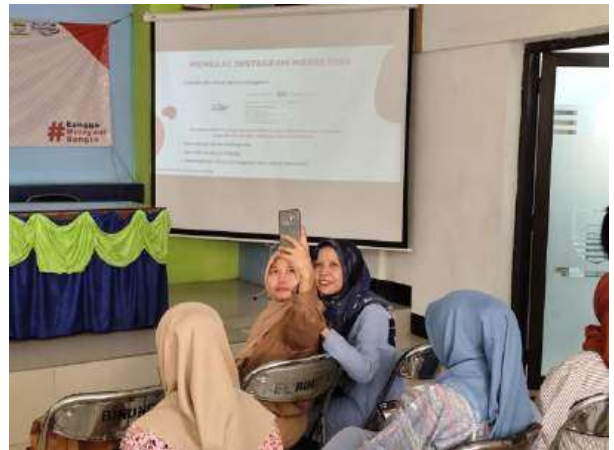
Figure 6. Digital Marketing Management Training: Social Media Marketing

Social media marketing will be formulated based on the familiarity of partners and the attributes of tourists who represent the personas of Binong Jati Knitting Creative Tourism Urban Village. Partners will establish the monthly themes for development, specify the types of material to be produced, and oversee social media accounts through straightforward campaigns. By effectively managing social media accounts, partners may sustain contact with prospects, consumers, and customers consistently, particularly tourists visiting Binong Jati Knitting Creative Tourism Urban Village.