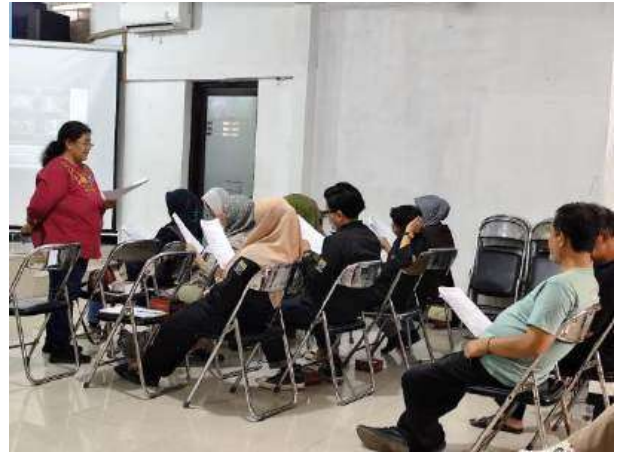
Figure 8. Business Communication Training: Basic English Skills

Basic English skills utilized will pertain to essential speaking abilities relevant to the responsibilities of Pokdarwis members in engaging with overseas tourists [19]. Partners will receive books that serve as a reference for effectively and accurately communicating terminology in suitable English.