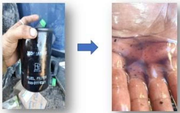
Figure 4. Fuel Filter Problem

This diagnostic data suggests that, while most components are in optimal condition, issues with the fuel tank strainer and fuel filter are impairing engine power. Proper maintenance, including cleaning and possibly replacing these parts, would likely resolve the low-power issue and improve the unit's operational efficiency.