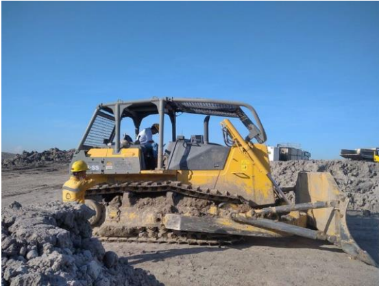
Figure 1. Komatsu D85ESS-2 Dozer Engines

impact the machine's productivity and efficiency, leading to decreased performance and higher operational costs [8].