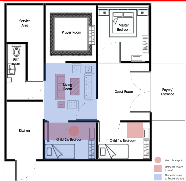
Figure 2: The floor plan of Participant ML's dwelling. Illustrates how work elements and household role elements overlap in the Traditional Household.

“The workplace to make the bouquet is in the bedroom... so work is done next to the bed (on the floor). Next to the bed it's a bit cramped... so if for example a lot of bouquets are ordered it can't be placed in the room...I have to move the bucket to the living room or my sister's bedroom.” (ML Participant, Online Interview, 2022)