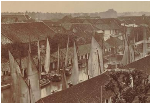
Figure 2. Kali Besar in 1887