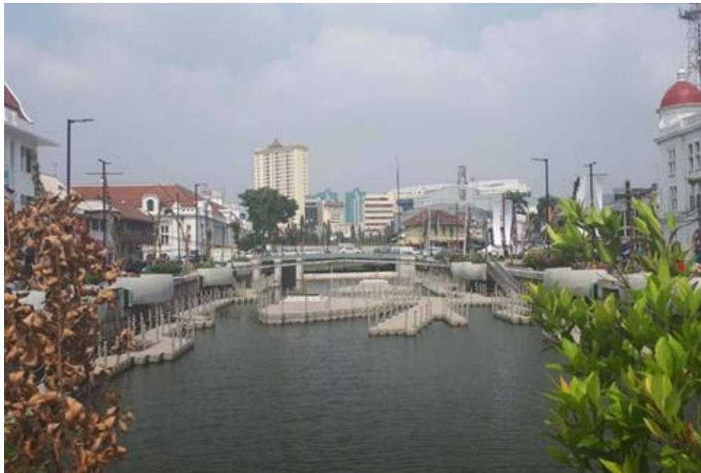
Figure 4. Revitalization of Kali Besar 2018

River in the heart of Seoul, Korea, which was designed as a hangout for tourists (Figure 4).