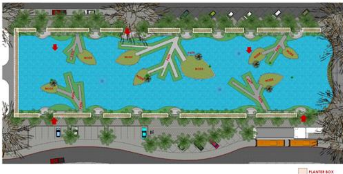
Figure 5. Floating Concrete Block Design, Filterisation, Aeration and Implementation of Water Farm in Kali Besar Revitalization

On the other hand, the government must prepare the revitalization management plan of the Kali Besar area involving stakeholders to support the realization of Jakarta's Old City as a World Heritage nomination. An Outstanding Universal Value (OUV) as the main criterion that can help the process of inclusion in the World Heritage List is still very relevant in the context of the revitalization of the Kali Besar area. This OUV can assist in the process of receiving nominations which can explain: 1) what property of site consists of, 2) why it shows the potential of an Extraordinary Universal Value, and 3) how that value can be continued, protected, conserved, managed, monitored and disclosed.