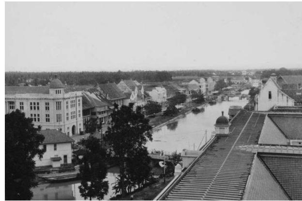
Figure 3. Kali Besar in 1931

Until 1750, the banks of the Kali Besar canal were never closed, either by wood or stone. Along the east and west banks of Kali Besar stand rows of warehouses and other large buildings related to the world of commerce. The warehouses located along Kali Besar are used to store rice, sugar, tea, other merchandise and food for ship supplies. In the northern part of Kali Besar, there is a shipyard to repair ships [5] Kali Besar in colonial Batavia became a determinant for the development of Batavia, both morphologically and socially and economically.