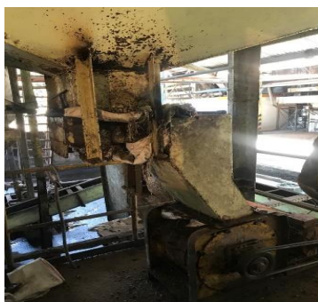
Figure 1. Ripple mill

Ripple mill is a machine at the nut & kernel station which functions as a tool for breaking palm kernels, namely separating the palm oil shell from the palm kernel or kernel. The way the ripple mill itself works is that the palm seeds (nuts) that are fed into the ripple mill will be ground and crushed between the stationary stator bar and the moving rotor bar. The working results of this ripple mill depend on the size of the palm kernels being fed, filling too much palm kernel will cause the rotor and stator to experience wear and tear and the operating hours of the ripple mill will exceed its useful life. These things will influence whether the ripple mill machine is effective or ineffective.