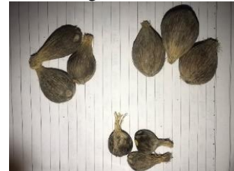
Figure 8. Actual size of palm kernels

a. The size of the palm kernels fed, the size of the palm kernels is heterogeneous