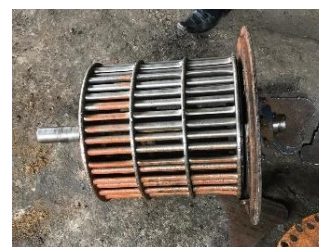
Figure 4. Rotor Bar

The rotor bar is the main component in a ripple mill which consists of several bars. At PMKS Baras, PT Unggul Widya Teknologi Lestari there are 40 bars arranged in a circle to form a rotor bar. The work of the rotor bar here is by rotating, so that the nuts fed from the nut hopper can be ground and undergo a breaking process, so that the shell and kernel are separated. The working hours specified for the rotor bar are 300 hours/unit.