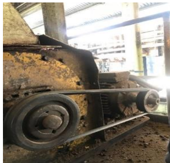
Figure 6. V-Belt Pulley

A V-Belt is a belt or belt made of rubber and is used as a tool to transmit power from one axis to another by rotating a pulley at the same or different speeds.