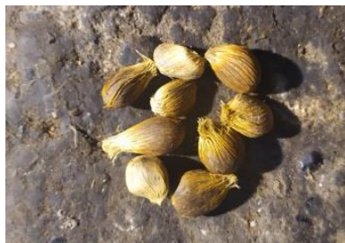
Figure 9. fiber included in the nut