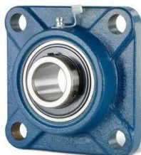
Figure 7. Flange bearing

The bearing used at PMKS B is Flange Bearing 510. The purpose of the bearing here is as a place to mount the shaft before it is connected to the pulley, so that it remains in place and does not shift.