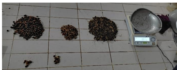
Figure 10. Round nuts, round kernels, broken kernels, and broken nuts