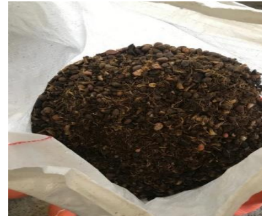
Figure 2. Cracked Mixture

The material that goes as feed into the ripple mill is palm kernel (nut), where the palm kernel will be stored first in the nut hopper before entering the ripple mill.