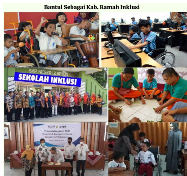
Figure 2 : Bantul as an inclusive-friendly regency focuses on improving accessibility and quality for inclusive education