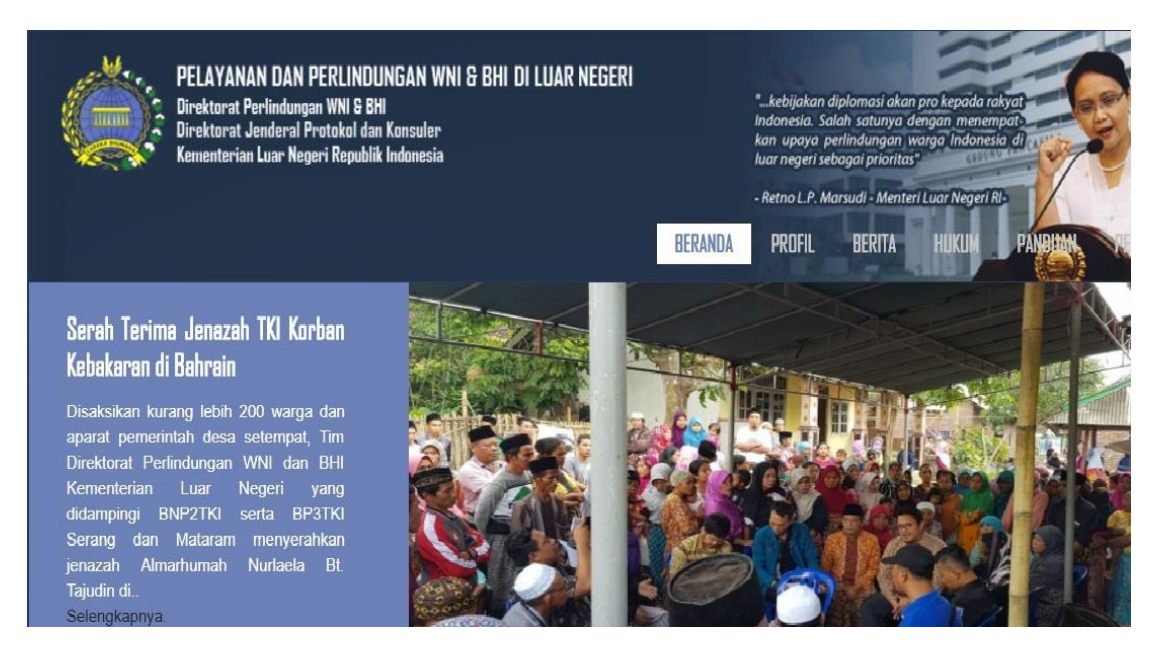
Figure 4 The Website of Indonesian Citizen Protection

In an interview with officials at the Directorate of Protection of Indonesian Citizens and Indonesian Legal Entity it was revealed that the site was not only to inform the latest developments on a number of problems of Indonesian citizens abroad. Within this site foreign citizens may also seek information related to Guidelines for Registration, Guidelines for Reporting, Guidelines for Conducting Case Complaints, Guidelines for Conducting Public Service Submissions and Guidelines for Conducting Public Service Complaints. This kind of information is referred to as a pro-active action by the government to protect Indonesian citizens abroad. However, not all citizens are able to utilize the site because of the ability of different individuals and the situation of working citizens.