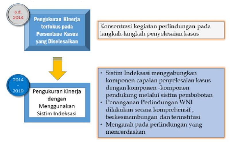
Figure 4 Paradigm Protection of Indonesian Citizen

Learning from the handling of previous cases, as described in the Focus Group Discussion of the Ministry of Foreign Affairs also set the paradigm in the arrangement of WNI problems. New paradigm explains about the original reactive and responsive to the pro active step as shown in the following figure.