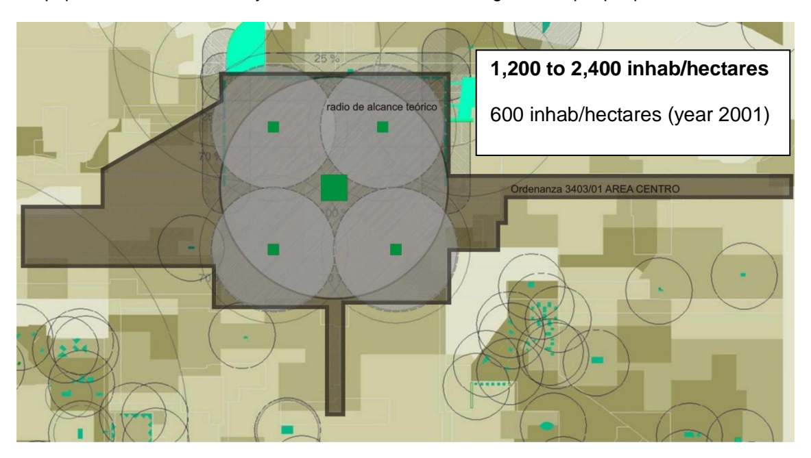
Figure 3. "Typologies of open spaces within city centre of Greater Resistencia, distribution and ratio of influence"

As shown in Plan 1, the amount of green space in the city centre area, covering 100% of the population demand in the year 2001, whereas an average of 600 people per. / has.