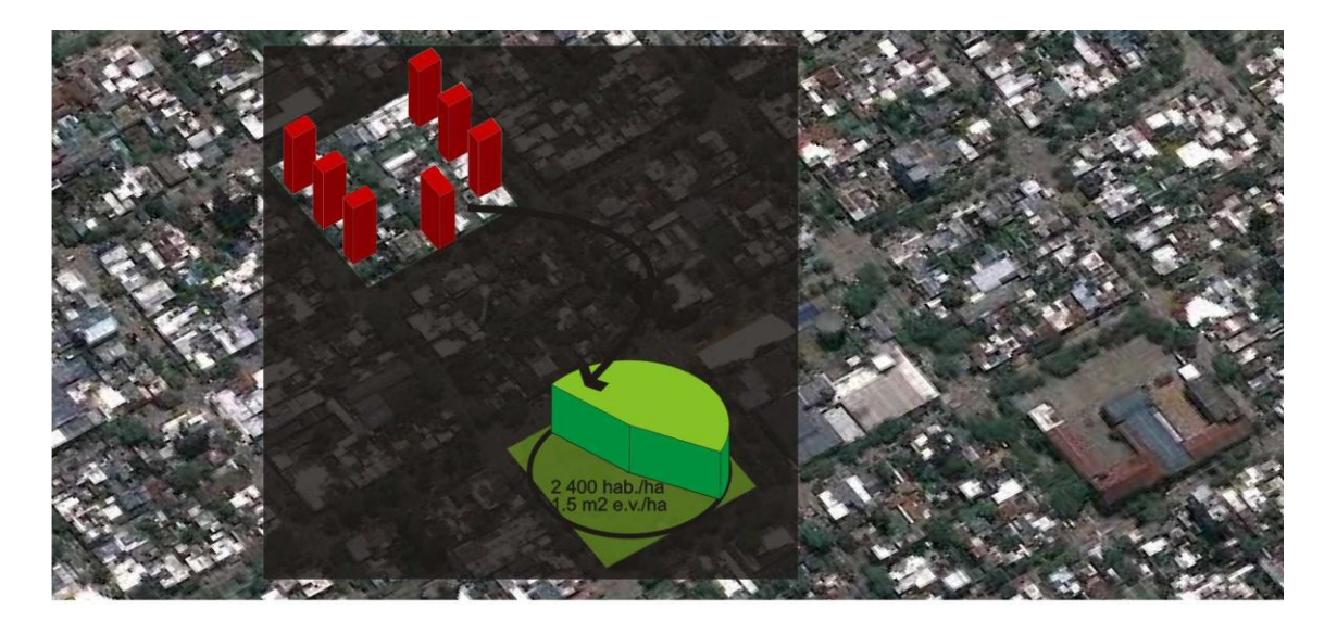
Figure 5. "Potential relationship of population density, according with Ordinance 5403/01/square meter of greenfield spaces in the city centre – STUDY CASE BLOCK 181" Source: self- elaboration.