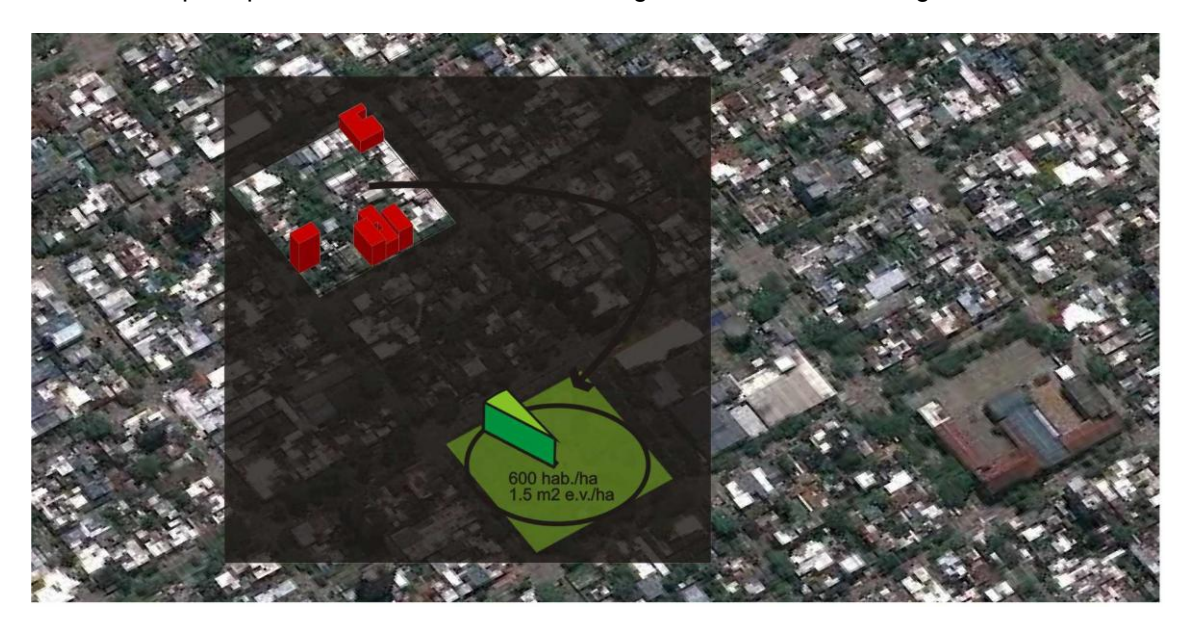
Figure 4. "Current relationship between population density / square metre of greenfield spaces in city centre- STUDY CASE BLOCK 181".

suggestion is 10 square metres/inhab., this would mean a demand of 24,000 m<sup>2</sup> of greenfield space per hectare, approximately two and half squares for each urban block. Considering the Ministry of Social Welfare suggestions in relation to the central squares (1.5 square metre/inhab.), half of open spaces per each hectare of the city centre area would be needed. Therefore, for 256 blocks covering the city centre built up zone, 128 hectares of open space would be needed at the neighborhood level. See Figure 4 and 5.