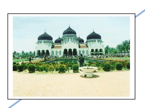
Figure 2: The Baiturrahman Great Mosque

Other supporting facilities and opportunities for marketing heritage are the position of Banda Aceh itself as nodes of other cities, the national airport and seaport facilities, some hotels and tourism accommodation, etc.